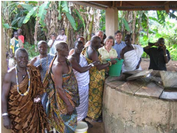
Important visitors to a refurbished well – a vital infrastructure project by Friends of Tafo

funding such as help to the disabled and needy pupils, incentives for students and teachers and an apprentice fund. Some projects are one-offs, and top of this list comes the next building stage at the Senior Secondary School.