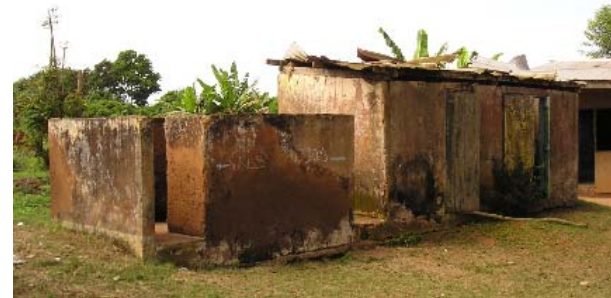
Above: where school WCs do exist they are often dilapidated and unhygienic