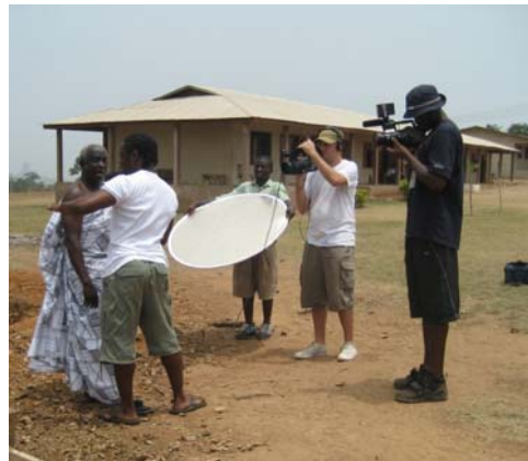
The MTV crew visits the SSS

The school now has more than 200 pupils (when we started it had 10!), studying Business and General Arts. It is run by ten staff accommodated in two tiny rooms. The Ghana Education Service requires us to build proper facilities for the school's staff and administration. This will be a large undertaking for FOT, but we have broken the cost down into "bite size" pieces of around £2,000 each and are keenly looking for donors to help us have the building up and running for September.