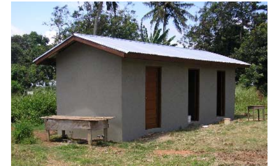
Right: new WC facilities at the SSS funded by Accenture's charity fund